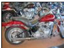
2006 Harley-Davidson FXSTI Burgundy -