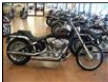
2006 Harley-Davidson FXSTI Black -