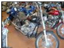
2006 Harley-Davidson FXSTI Black -