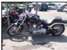
2006 Harley-Davidson FXSTI Softail Black -